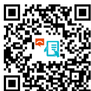
Online OSH Complaint Form

The latest occupational safety and health information can be obtained through downloading the "OSH 2.0" mobile application of the Labour Department.